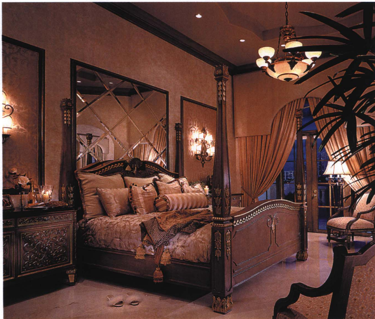
The gold-leaf-detailed four-poster sets an old-world tone in the master suite. A hexagonal-shaped wet bar, complete with wine refrigeration, is tucked into the seating area of the bay window—a feature that encourages the DeLoaches to enjoy the passing yachts from their vantage point on the terrace with a glass of wine in hand and light jazz playing in the background.

with floors of Saturnia marble and a beveled mirror hanging behind the gold-leaf-detailed four-poster bed. A modern alabaster chandelier romantically illuminates the room, while ornate glass and wrought-iron Spanish sconces, also contemporary in design, add symmetry. French doors welcome in the sea air morning, noon and night.