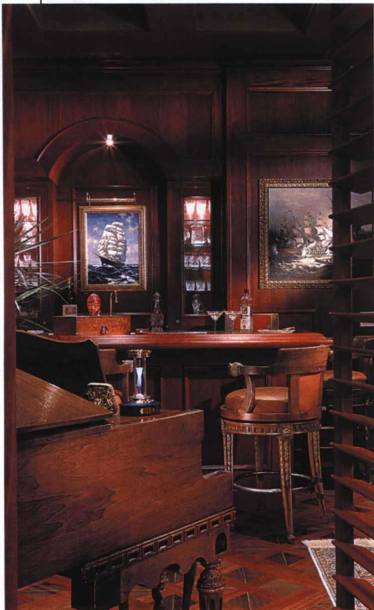
Panelled walls and leather applications evoke the feeling of a gentlemen's retreat in the piano bar. The traditional-styled grand player piano and bar topped with black onyx granite add a touch of drama.

Like every main-floor space, the family room enjoys a panoramic view of the waterway through French doors topped with clerestory windows. The room is a stylish study in comfort punctuated by a surround-sound system. Automated blinds shield the room from Florida's scorching sun and transform the space into the optimal movie-