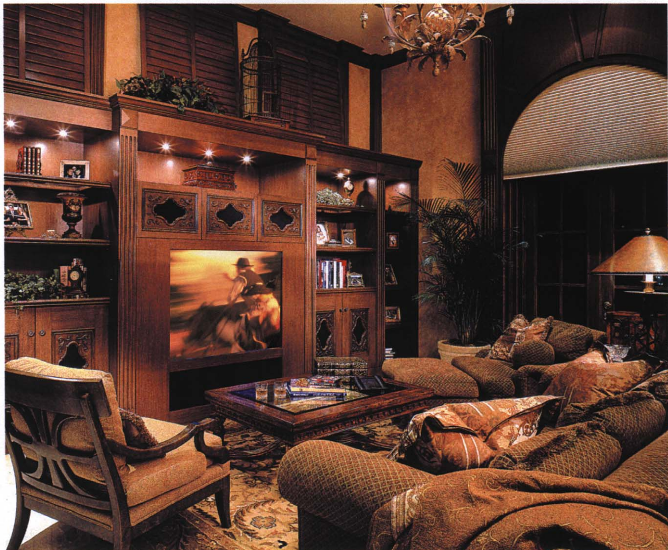
SCREEN IMAGE: ©EVERETT COLLECTION / EVERETT COLLECTION INC.

Used as the main venue for DVD viewing, the family room exudes an intimate feel with soothing colors and fine-hewn cabinetry. Although it adjoins the light-splashed kitchen, the space can be darkened like a cave with the touch of a button on the touchscreen remote.