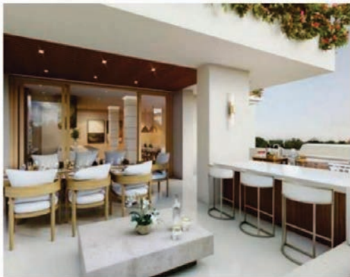
VILLA VALENCIA IN CORAL GABLES MARKS THE FIRST INTEGRATED WELLNESS CONDOMINIUMS IN THE U.S. CLOCK WISE FROM TOP: VILLA VALENCIA LOUNGE; VILLA VALENCIA BEDROOMS ARE OUTFITTED WITH DARWIN FEATURES SUCH AS DAWN-SIMULATION SCENES; VILLA VALENCIA'S CUCINA KITCHEN AND BAR.