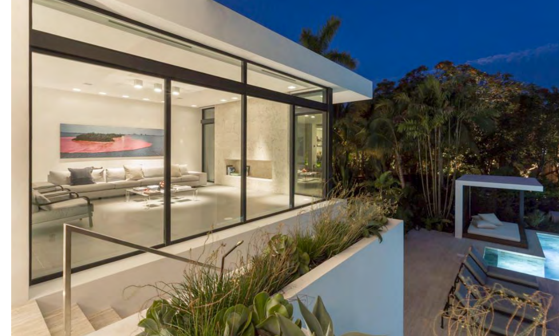
A living room with recessed lights, featuring circadian rhythm features.