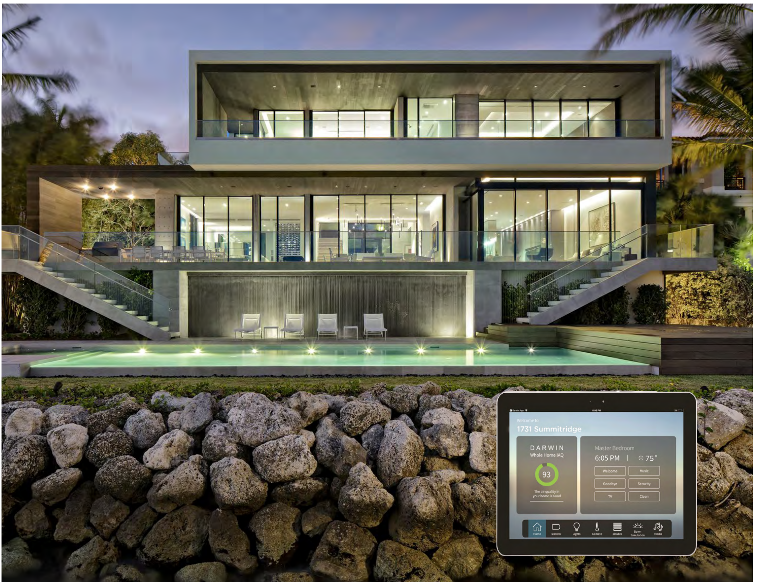
An exterior shot of a modern home in Coconut Grove, Florida.